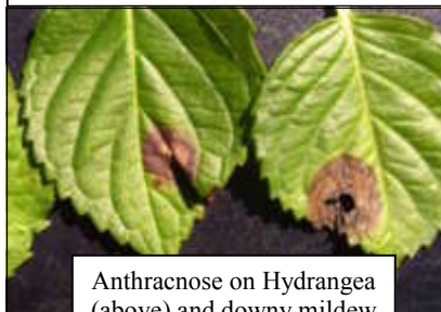
Anthracnose on Hydrangea (above) and downy mildew on Impatiens (below)

One of the most interesting developments was seen with annual vinca ( Catharanthus ). Of the 7 or 8 samples submitted nearly all proved to be nonpathogenic (usually phytotoxicity). Some crops apparently receive a large load of pesticides whether they need them or not.