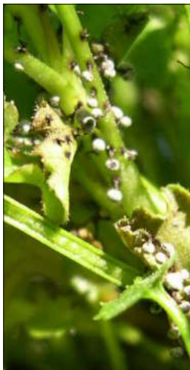
Fruiting bodies of a slime mold on Campanula leaves

Phyton 27 and Prodox did not significantly reduce slime mold on the leaves. In contrast, Zerotol reduced it 35% and Camelot reduced it 60%. Additional work with other rates of these products has not been performed since slime mold does not appear on ornamental plants with a high frequency. We will keep our eyes open and repeat the work when possible.