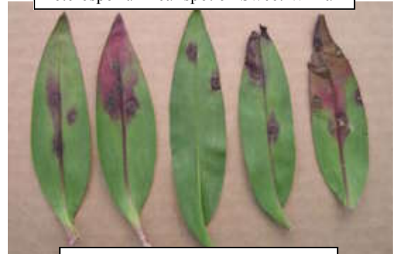
Alternaria leaf spot on Alstroemeria